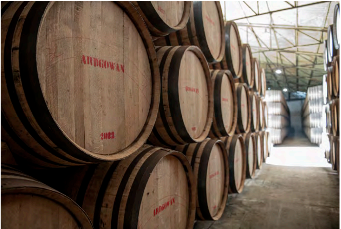
Ardgowan infinity casks seasoning at Sanlúcar de Barrameda