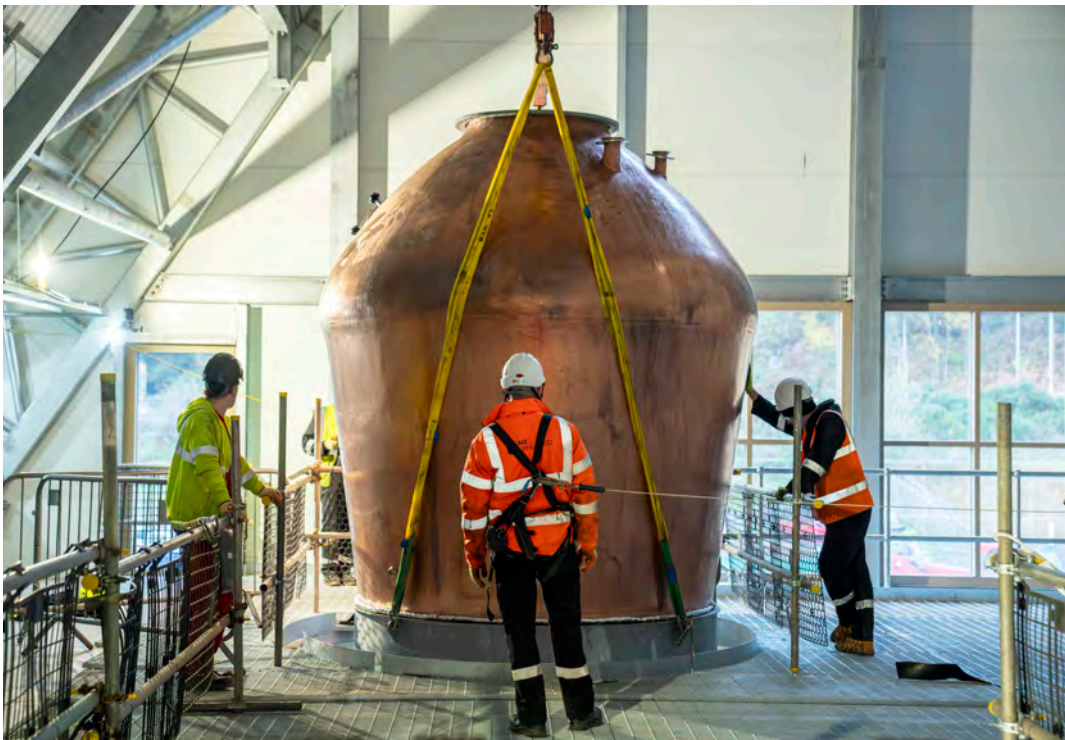
Ardgowan stills getting installed November 2024

Under current (2023) tax legislation, UK Capital Gains Tax is not applicable as whisky is regarded as a “tangible”, “moveable” and “wasting asset”. Whisky purchased in cask for personal use, as gifts for family, godchildren and friends, etc. would therefore be exempt from Capital Gains Tax on realisation of the asset.